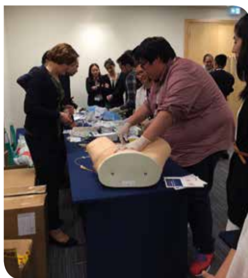
The workshop included hands-on training on mannequins

In the afternoon, four stations with models for catheterisation were prepared, and the participants performed the procedure on realistic male and female mannequins, with different types of indwelling and intermittent catheters, under the guidance of the teachers.