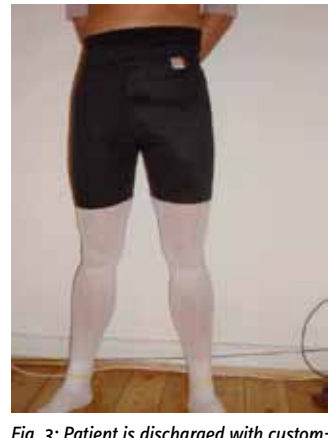
Fig. 3: Patient is discharged with custom-made shorts and stockings