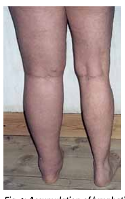
Fig. 1: Accumulation of lymphatic fluid in the lower extremities