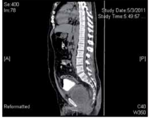
Fig. 2: Patient A: Complex fluid collection in prostate.

Due to the enthusiastic response, the Difficult Cases session has become a regular feature in the EAUN's annual conference, informing urology nursing specialists of effective interventions and special handling procedures. After the lectures, the speakers and the audience also had the opportunity to discuss specific aspects. We are publishing on this page the submissions of the two speakers who spoke on the topics parasitic infestation in the urologic patient and lymphedema treatment following lymph node removal.