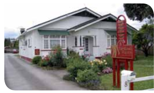
Our clinics are housed in a specially-modified house

There are three nurses in our team, though I am the only one who works full time. We run six public outpatient clinics between the two urologists, and three are also attended by our registrar. The clinics attend to various patients and include minor room-based procedures such as prostate biopsies, flexible cystoscopies, stent removals, urodynamics,